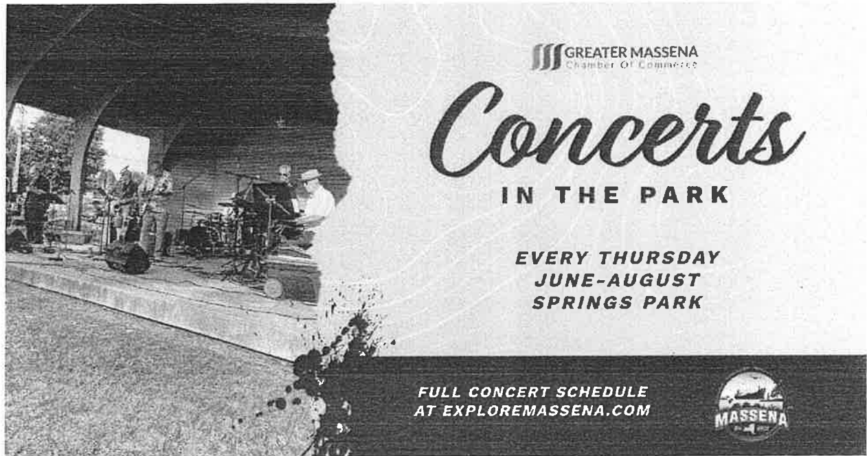
Concerts In The Park Event Header

that part of the application as we prepare for summer with some great events for Massena, New York.